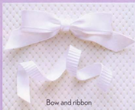
Bow and ribbon